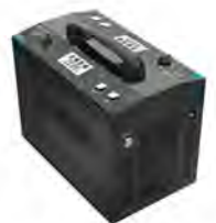
Smart Balance Charger