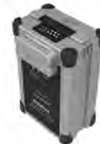
22000 mAh Intelligent Battery