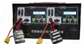
Charger (2 ports)