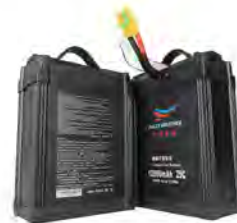
12000 mAh battery